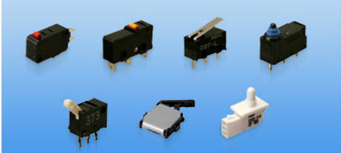
小型微动开关 Small micro switch

代理从小型 (V尺寸) 至极小型等各式各样的开关 Deal in several size and type