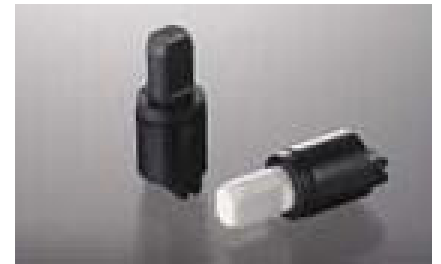
阻力器 Oil Dumper