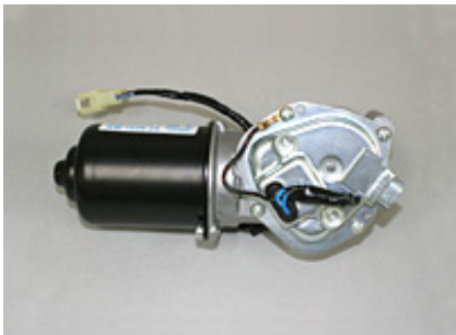
自动马达 Auto step motor